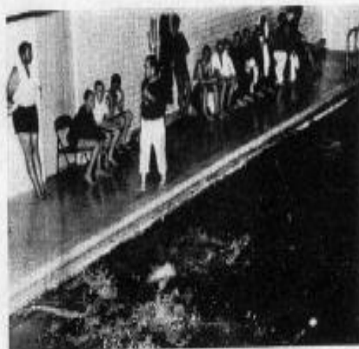
Swimmers fight for the lead in the Southport meet.